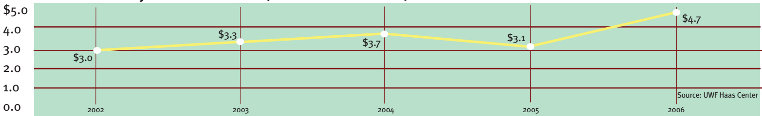
Escambia County Bed Tax Revenue (in millions of dollars)